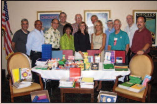
Members of The Exchange with collection for Tools for Success

This year's Tools For Success, the Hoffman Estates Chamber of Commerce annual school supply drive, was a big success. The Chamber was able to collect cases of supplies with the help of our chamber members and the community. These much need donations will go a long way in helping our area students start the school year out right.