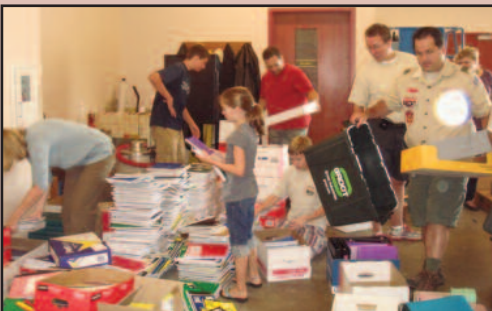
Boy Scout Troop 290 and other volunteers help sort school supplies on August 13

Special thanks go out to Barrington Square Home Improvements B & F Technical Code Services Chicago Slaughter Football CitiBank Curves for Women The Exchange District 54 Program Services, First American Bank, Hamilton Partners Harris Bank Health First Wellness Hoffman Estates Comm Bank, Hoffman Estates Branch Library Kids Plus Pediatric Dentistry Parkway Bank Prairie Stone Sports and Wellness Roosevelt University Rotary Club of Sch-H.E. Schaumburg Twnshp. Dist. Library Sears Holdings Corporation St. Alexius Medical Center Scott R. Triphahn Comm. Center & Ice Arena Township of Schaumburg, The Village of Hoffman Estates Liberty Mutual Roanoke Trade Services, AIOI Nissay Dowa Ins. Co. Gibbs & Soell Groot Industries